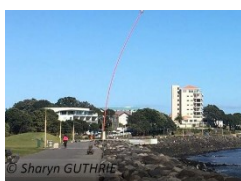
New Plymouth Genealogy Society

Our membership of our Facebook group continues to steadily grow and is now up to 230 members.